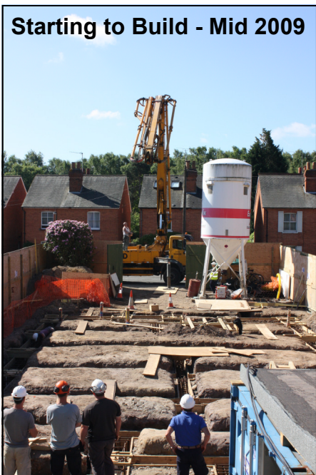
Starting to Build - Mid 2009

It was back in 1976 that a small group of Jehovah's Witnesses bought the old church in Connaught Road and spent almost a year converting it to a Kingdom Hall, as our places of worship are known. This purchase and conversion was accomplished using their own financial and physical resources. Since then, as the congregations grew, refurbishments have taken place to maintain the fine appearance of the hall. Sadly, several years ago a structural survey revealed the hall was in terminal decline and nothing short of rebuilding would resolve the issues. The decision was taken by the local Witnesses to start a major saving campaign to accrue sufficient funds to demolish the current hall and replace it with a new structure.