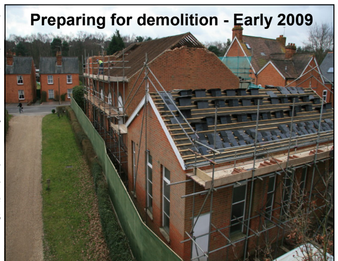
Preparing for demolition - Early 2009

As soon as possible following completion, we shall be organising an open day when we hope to welcome local residents to the new hall for guided tours and share some reminiscences, including those from a few local residents who can recall attending Sunday school in the old hall all those years ago.